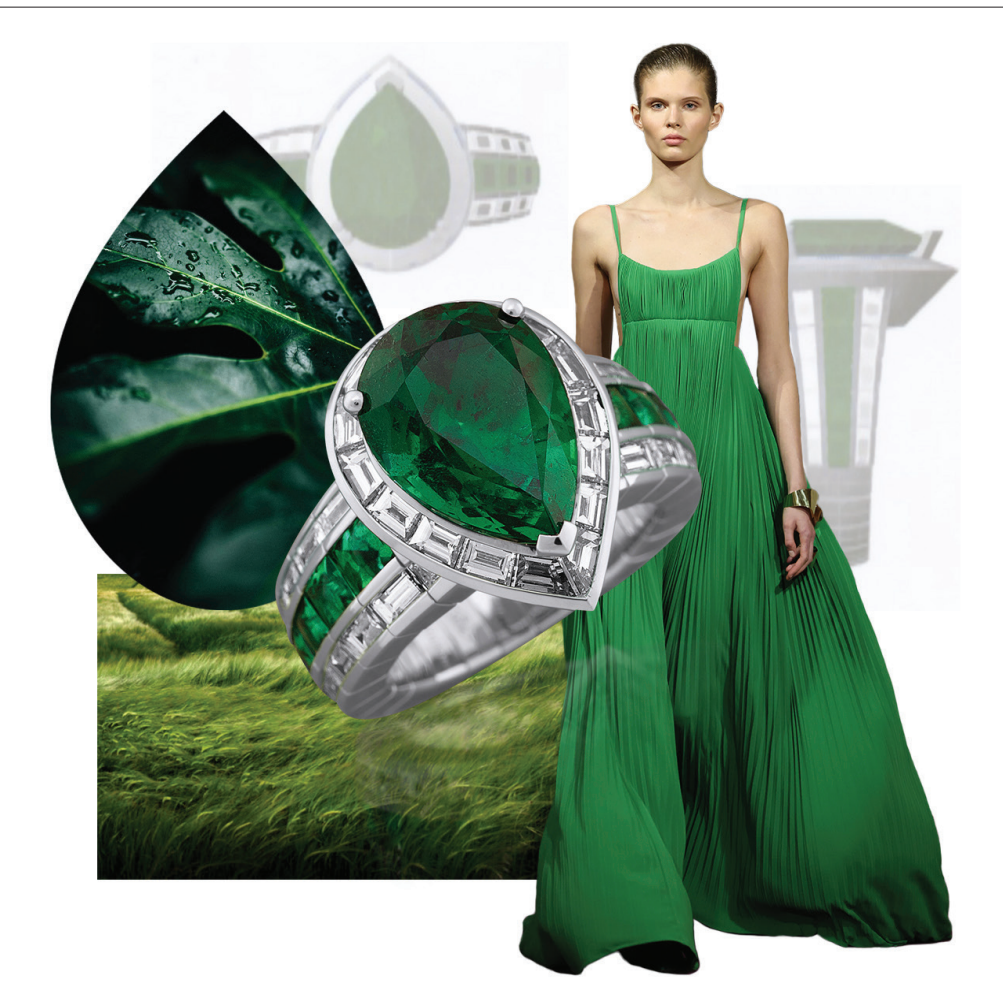
PICCHIOTTI Pear Emerald Xpandable Cocktail Ring, Valentino Spring/Summer 2024