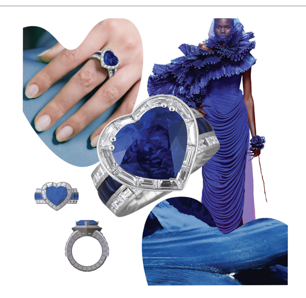
A BLOG FROM PICCHIOTTI