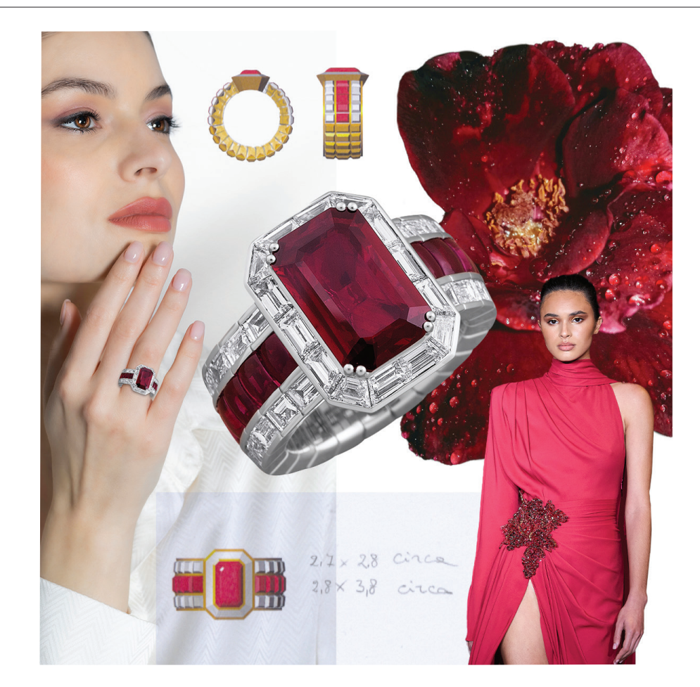
A BLOG FROM PICCHIOTTI