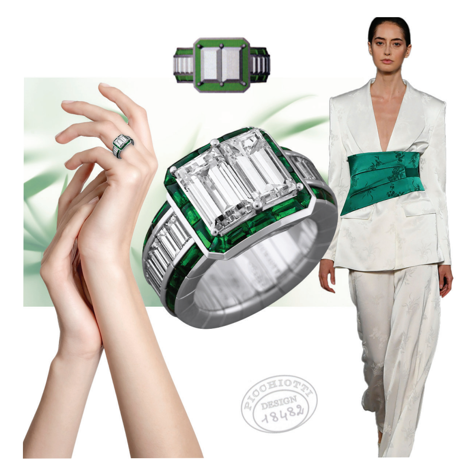
A BLOG FROM PICCHIOTTI

PICCHIOTTI Xpandable Diamond and Emerald Cocktail ring, Loora PWD Paris, Spring Summer 2024