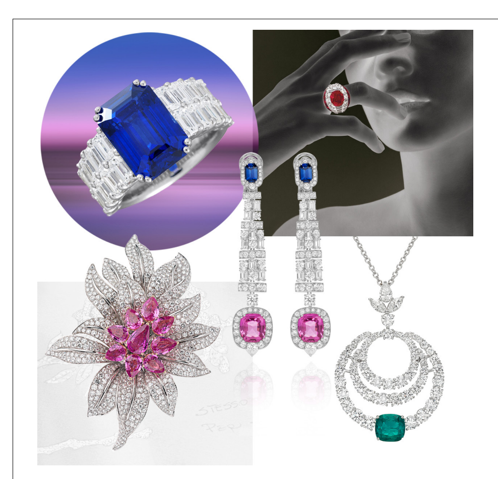
A BLOG FROM PICCHIOTTI