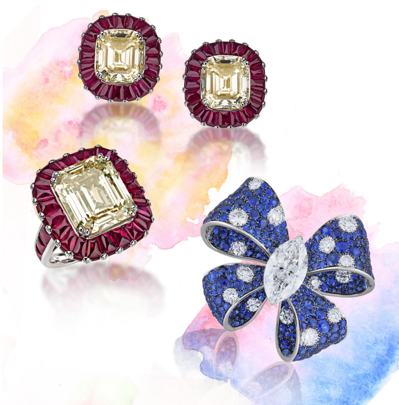
Clockwise from Upper Right – PICCHIOTTI Masterpieces Diamond and Buff-Top Ruby Earrings , PICCHIOTTI Fiocco (Bow) Ring in Sapphires and Diamonds , PICCHIOTTI Masterpieces Diamond and Buff-Top Ruby Ring

Giuseppe says that buying a diamond is also a matter of feeling. Each diamond has its own unique character. “I listen when the Diamond speaks to me,” says Giuseppe. “Sometimes unique diamonds appeal to me because they are different or outside the norm.” For example, sometimes the Picchiottis will come across good diamonds whose color may not be so high, so they will have lower color grades than what is normally acceptable for the brand. However, if the stones are well cut, with good proportion, and important carat weights, these factors can all contribute to the stones showing nicely in a particular piece of jewelry. With creativity and a refined sense of design, such unique diamonds can create gorgeous masterpieces. Take for example the Stunning Studs Earrings and the matching ring where the warmth of color in the emerald-cut diamonds are beautifully enhanced by the surrounding rubies. PICCHIOTTI’s signature style of architecturally inspired silhouettes is achieved with an extensive frame of re-cut, precisely calibrated, buff-top baguette rubies. The rare, large size of the diamonds also contributes to making these two important pieces of incredible fine jewelry.